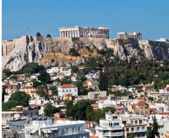
The ancient Plaka below the Acropolis in Athens