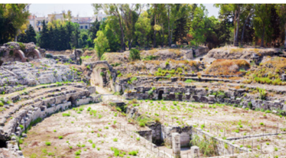
Roman amphitheater, Siracusa

Disembark at Civitavecchia this morning and transfer to Rome-Fiumicino International Airport for flights home, or begin the optional post-tour extension in Rome. (B)