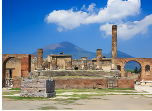
Pompeii and Mount Vesuvius