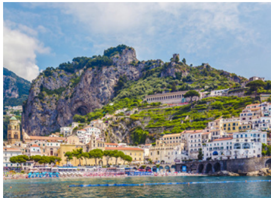
Sorrento, Amalfi Coast