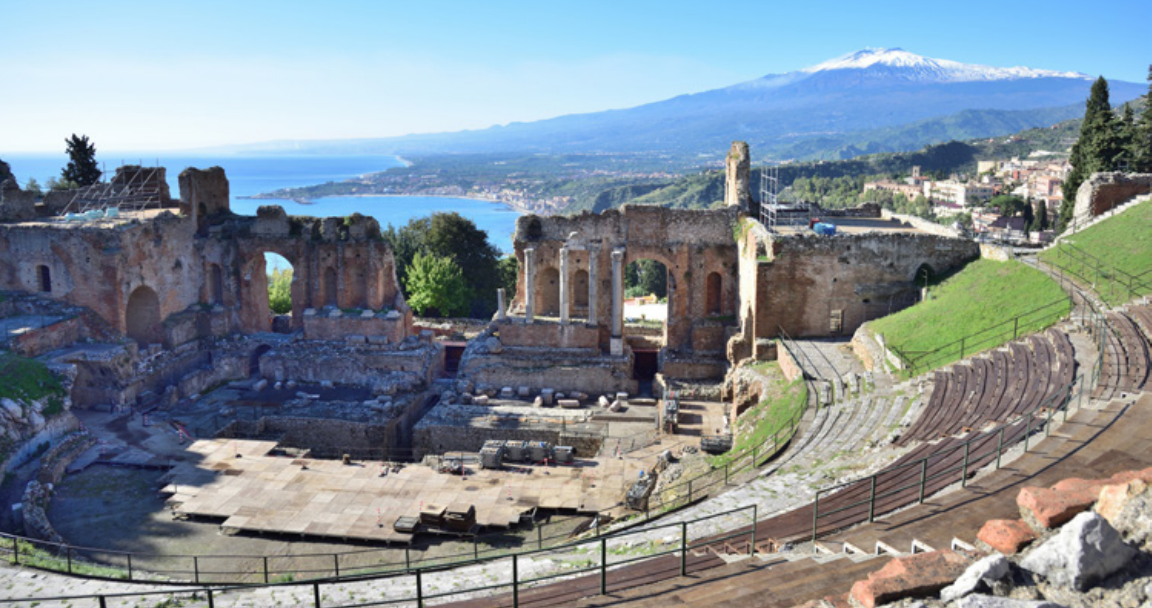
Theater at Taormina